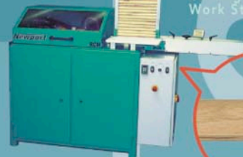
B. RCM Wedge Cutting Work Station