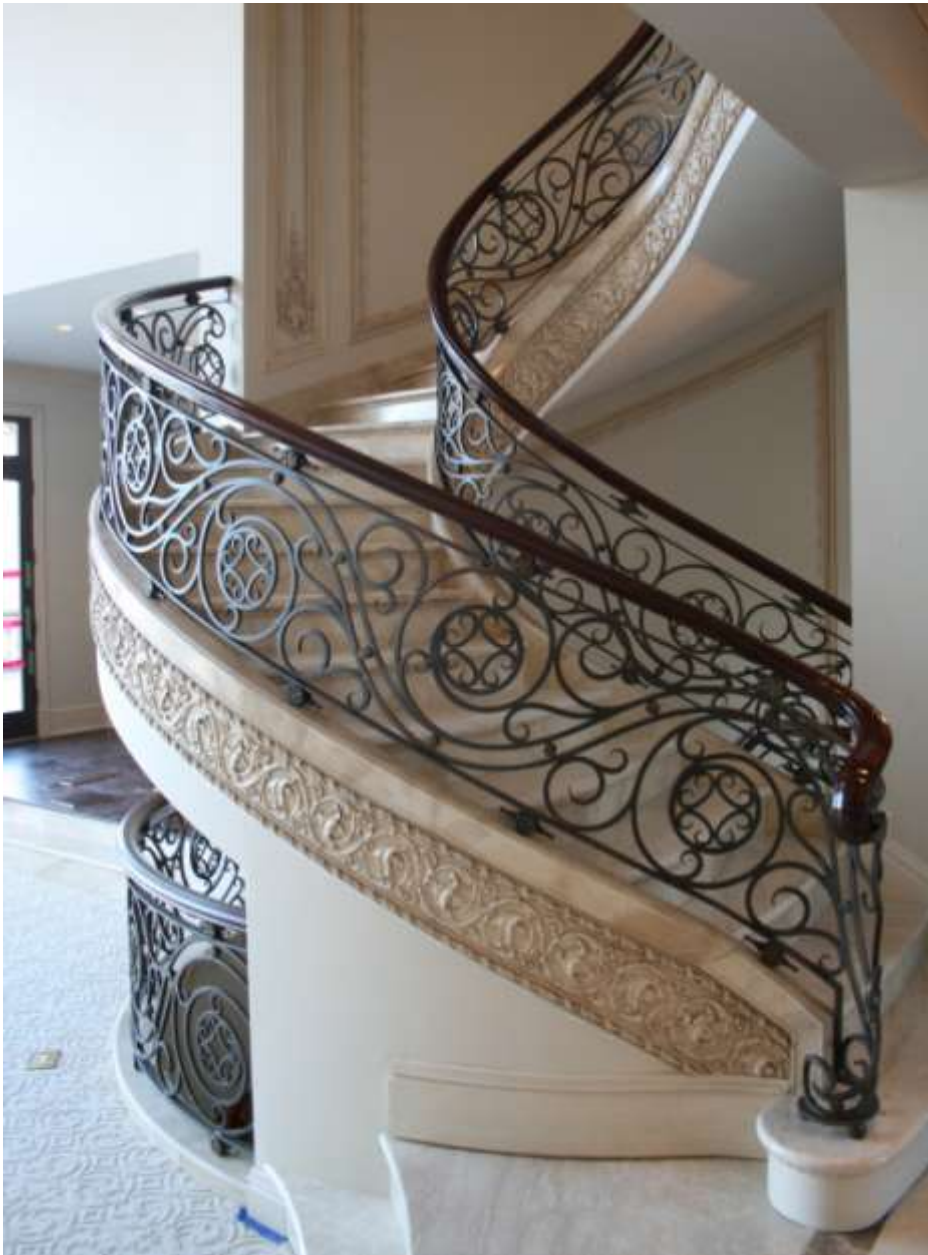
Best Balustrade awarded to Eureka Forge of Pacific, MO