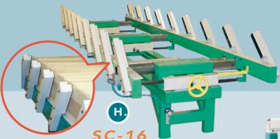
H. SC-16 Stair Clamp