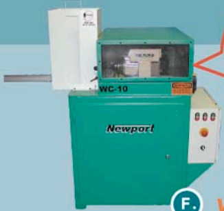
F. WC-10 Wedge Cutter