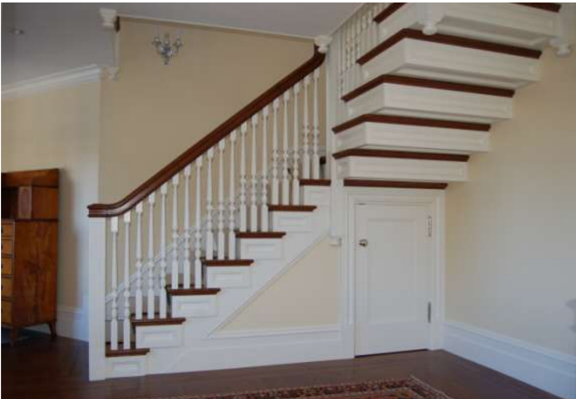
Best Straight Stairway awarded to Colonial Woodworking of Bradford, NH