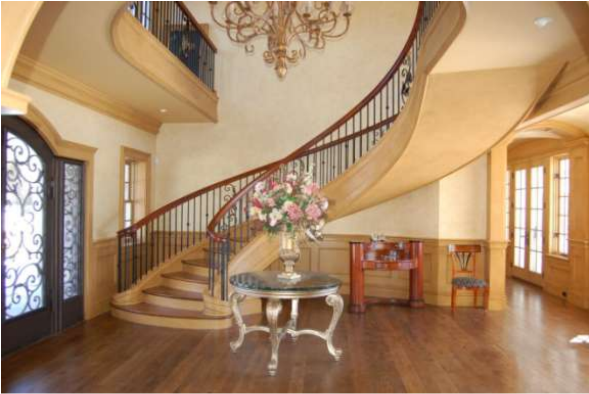
Best Curved Stairway awarded to Colonial Woodworking of Bradford, NH