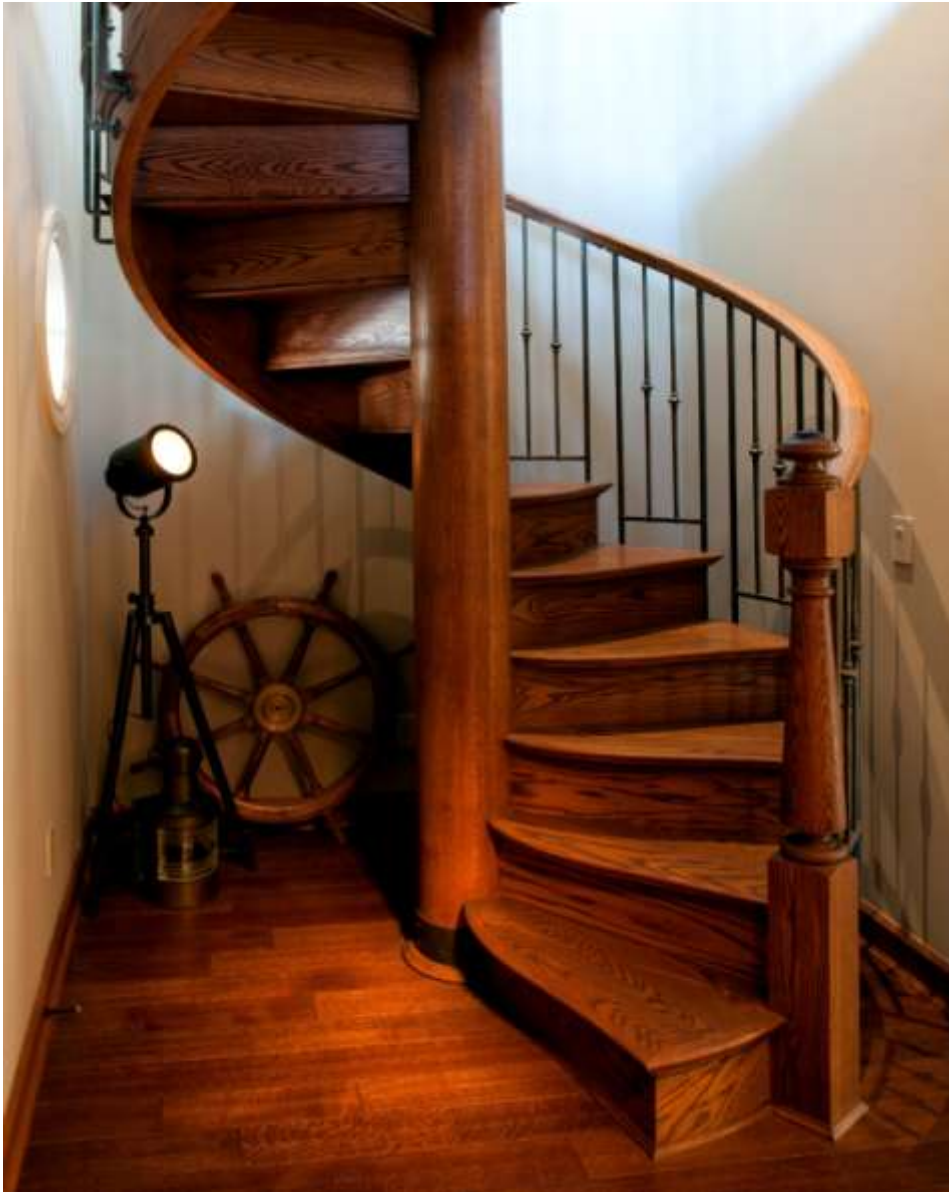
Best Spiral Stairway awarded to Seattle Stair and Design of Seattle, WA