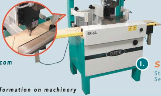
I. SRA Stringer Router Semi Automatic