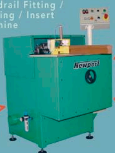
C. HFDM Handrail Fitting / Drilling / Insert Machine