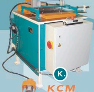
K. KCM Kerf Cutter