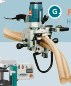
G. FG308 Hand Rail Router